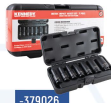
-379026 Kennedy KEN5839220K 1/2" DR. HEX IMPACT SOCKET SET 10MM - 30MM METRIC BLACK 7PCE R685*