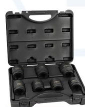
-474139 Kennedy KEN5839193K 1" DR. HEX IMPACT SOCKET SET 27MM - 46MM METRIC BLACK 7PCE R2350*