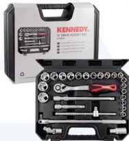
-1020081 Kennedy KEN5824045G SE 1/2" DR. SOCKET SET 27PCE R1080*