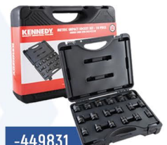
-449831 Kennedy KEN5839215K 1/2" DR. HEX IMPACT SOCKET SET 10MM - 32MM METRIC BLACK 18PCE R1120*