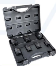
-474845 Kennedy KEN5839204K 3/4" DR. HEX IMPACT SOCKET SET 19MM - 46MM METRIC BLACK 7PCE R1355*