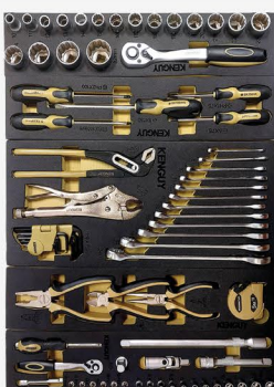
-1009347 KENGUY OS05950056B CANTILVER KHAKI TOOLSET 77PCE BEST DEAL! R1899*