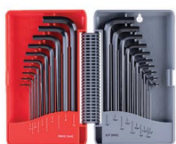
-176251 Kennedy KEN6022800K HEX KEY L-HANDLE HEX METRIC/IMPERIAL 1.5-10MM 1/16-3/8" 20PCE R535*