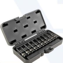
-448948 Kennedy KEN5839186K 1/2" DR. HEX IMPACT BIT SET 6MM - 19MM METRIC BLACK 10PCE R965*