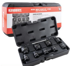
-461302 Kennedy KEN5839210K 1/2" DR. HEX IMPACT SOCKET SET 10MM - 30MM METRIC BLACK 9PCE R640*