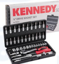
-1020080 Kennedy KEN5824042D SE 1/4" DR. SOCKET SET 46PCE R450*