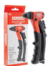
-583828 Kennedy KEN5692040K PRORIVETER NOZZLES 4 230MM R295*