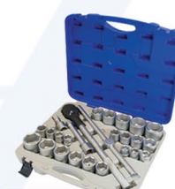
-587023 SENATOR SEN5829320K 3/4" DR. SOCKET SET METRIC/IMPERIAL/AF 22MM - 50MM/7/8" - 2" CHROME 26PCE R5999*