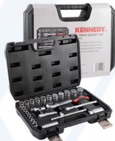
-1020082 Kennedy KEN5824048K SE 3/8" DR. SOCKET SET 26PCE R780*