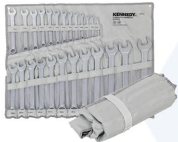
-1020130 Kennedy KEN5825202D SE6-32mm CV COMBINATION SPANNER SET 25PCE R1450*