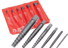
-17742 Kennedy KEN0751160K SCREW EXTRACTOR SET 6PCE R180*